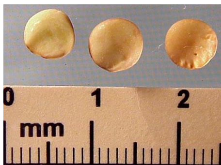
Figure 2.1: An illustration in Chapter 2.